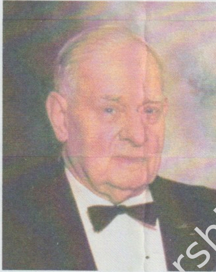
The most dedicated Mason ever?